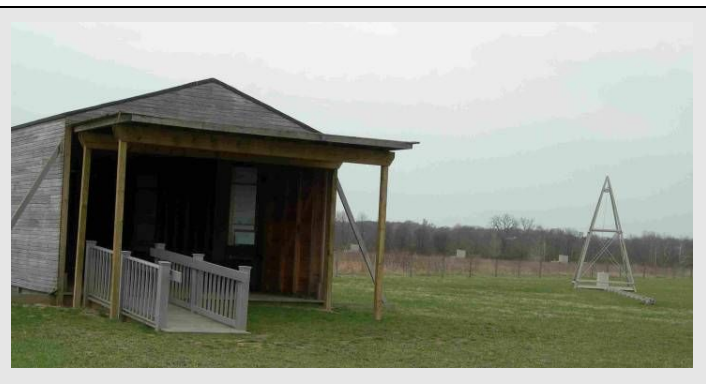
Reproduction of the Wright brothers' 1905 hangar and catapult at Huffman Prairie Flying Field which is part of Wednesday's events.

There are several exceptional activities available to our group during our stay in Dayton. For exact times and prices, please check the registration form.