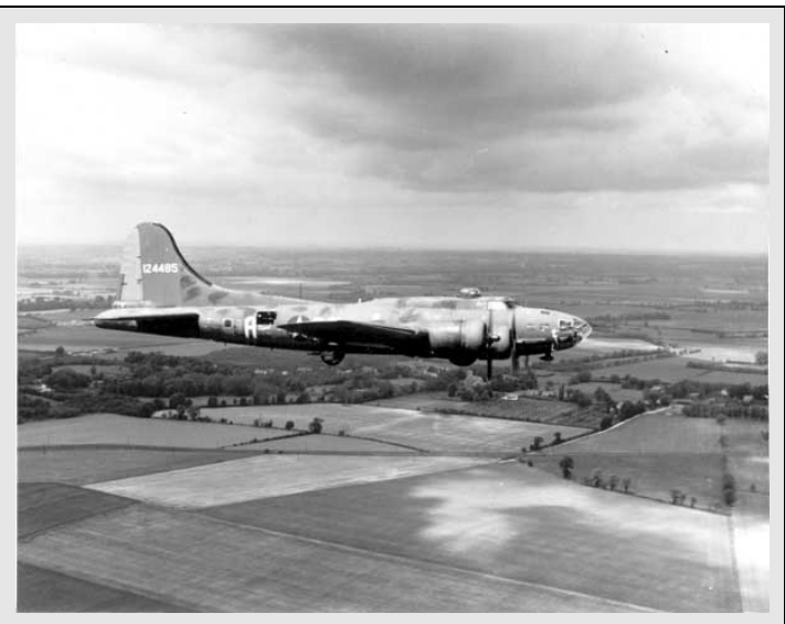
Memphis Belle returning home.

<u>Hotel reservations must be made by August 27th</u>. We are staying at the Holiday Inn Dayton-Fairborn, 2800 Presidential Drive, Fairborn, Ohio 45324. Please call the hotel at (937)426-7800 and state you are with the 91st Bomb Group Reunion. Our rate is $99.00 per night and includes breakfast.