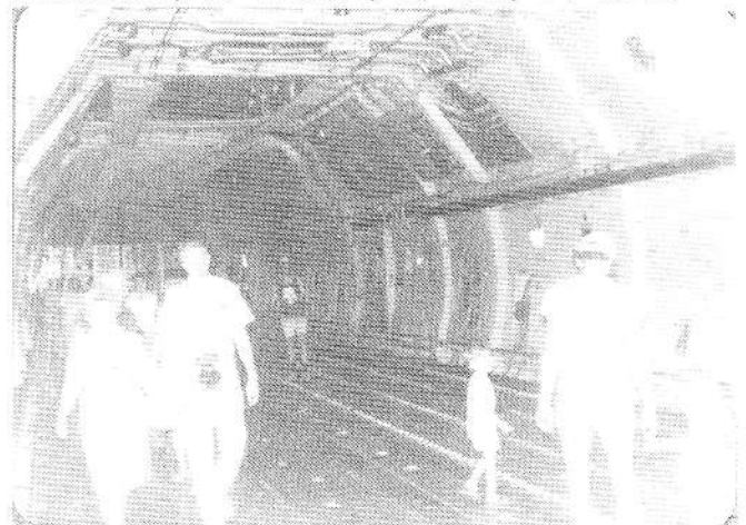
No, it's not a tunnel, but the interior of the giant C-5 transport.