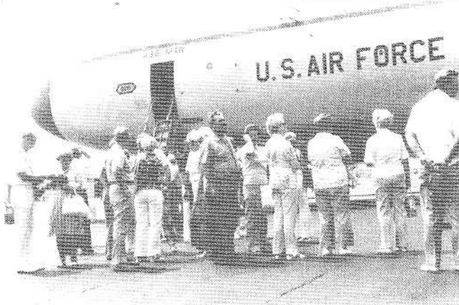
The unbelievable size of the C-5 holds the group in awe.