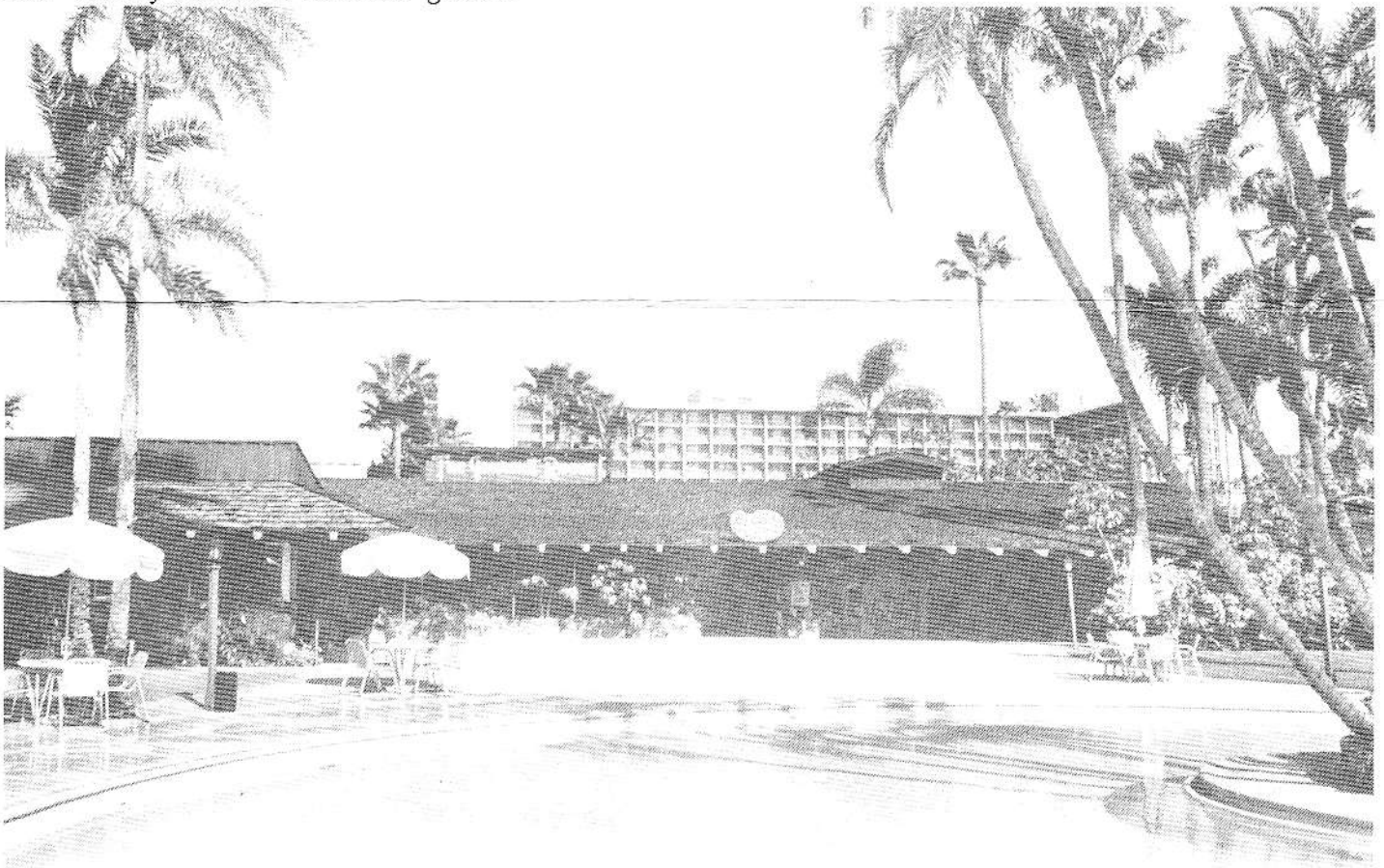
Here is a partial view of the Town and Country Hotel, Reunion headquarters for 1980

It's going to be a great affair, so begin making your plans to be there right now! Especially, contact all your old buddies and encourage them to meet you there. That is what really makes a Reunion great!