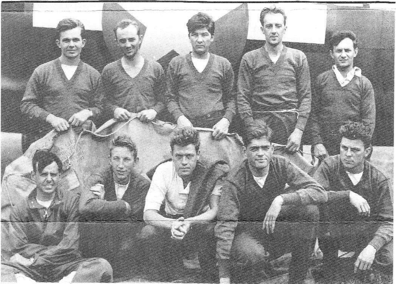
Just back from the Schweinfurt raid of August 17, 1943, by courtesy of the British Air-Sea Rescue Service is the crew of "Hitler's Gremlin," which had to ditch in the English channel on the way home. They are holding one of the two rubber life rafts in which they floated for four hours before being rescued. The 91st suffered heavy losses on this mission.